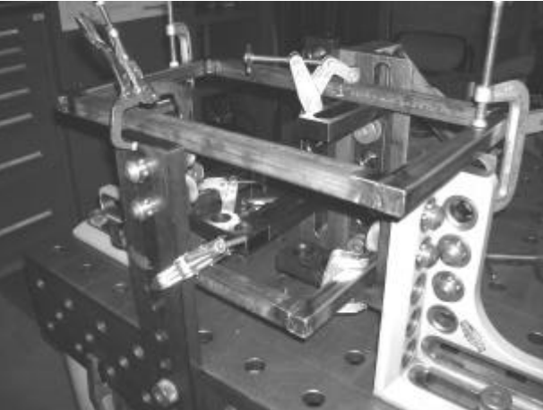
A positioning fixture is used to assemble and weld the rear box component that will mount the differential and rear drive components of the chassis.

CSCC will continue to provide sponsorship assistance for 2006, and will be holding the February Club meeting at NIU to meet with the team. Tentatively, February 22, 2006 will be the date for the meeting. We will learn what design changes over the 2005 car will be made, as well as the overall technical focus for the design component of the competition.