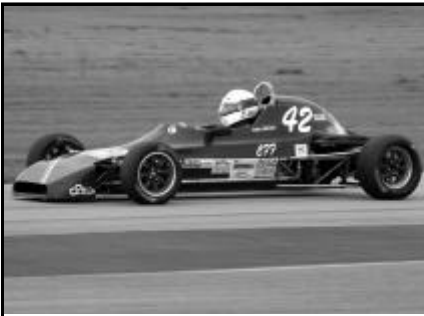
Ford Prefect at Autobahn - South