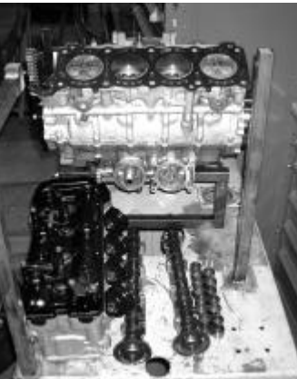
The potent Suzuki GSXR 600 engine (above) will be used for 2006. The NIU FSAE Team (right) at the 2005 Competition were well represented and had a great time.